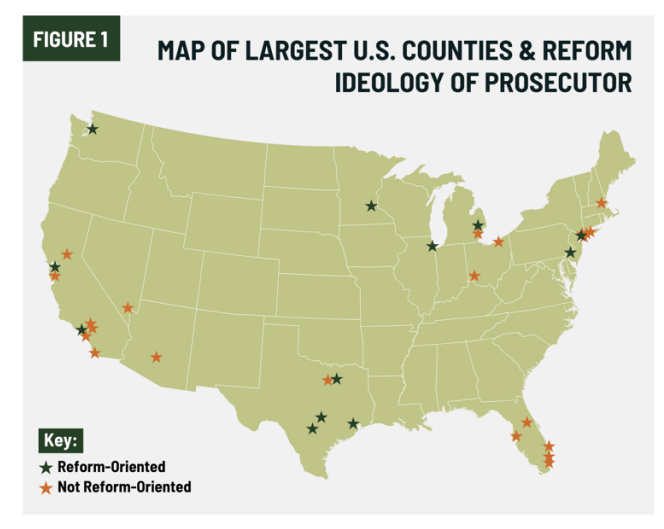
FIGURE 1: This map presents the largest 36 counties in the U.S. by population according to 2020 census records and the reform ideology of the county's prosecutor as of December 2023. Map adapted from a list of progressive prosecutors identified in Pfaff, J. F. (2022). The Poor Reform Prosecutor: So Far From the State Capital, So Close to the Suburbs. Fordham Urb. LJ, 50, 1013. See Appendix 1 for a table

Policy Advocacy for Criminal Legal System Reform -Active support of policies that reduce the harm of the legal system, such as ending cash bail, increasing the sealing and expungement of criminal records, addressing wrongful convictions, and a host of other priorities.